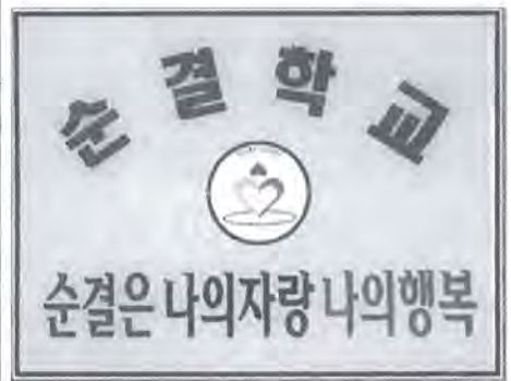
The plaque earned by schools participating in the Pure Love Pledge. It reads,

Thirdly, we are planning to build an international network for the Pure Love Movement, thus expanding its scope.