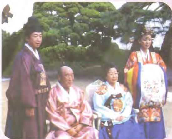
l: After the traditional ceremony in the gardens at Hannam-dong, r: the main ceremony at Chungpa-dong Headquarters Church