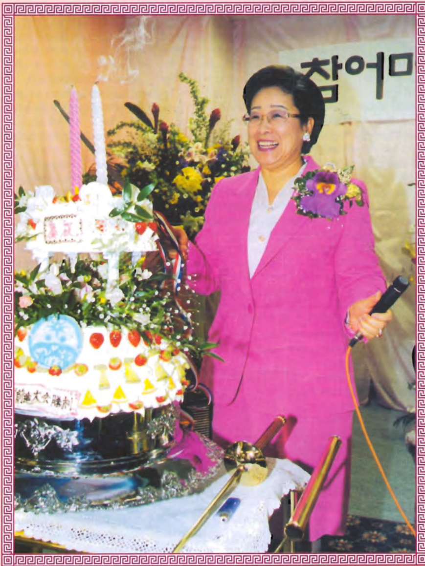
Mother celebrates a successful speech in Osaka, Japan, February 14

This year, all manner of fruit will be harvested. We are going to liberate God and liberate love itself.